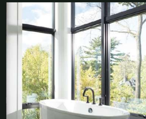
External Doors & Windows Powder Coated UPVC and Glass