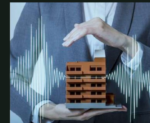
Earthquake Resistant Immediate occupancy Performance based Analysis

*The images shown above are being used here only for reference and in no manner, whatsoever, the actual product/development shall differ from the images shown above. Artistic Impression