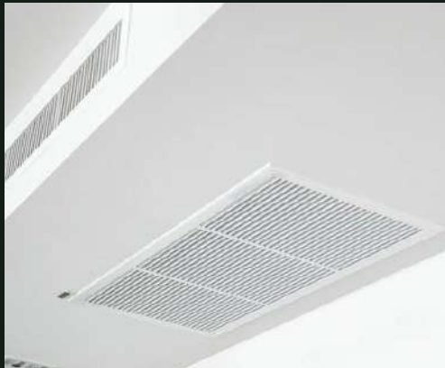
AC VRV/VRF Hi Wall