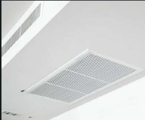
AC VRV/VRF Hi-wall