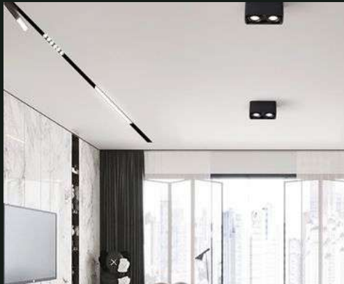
Ceiling POP False Ceiling