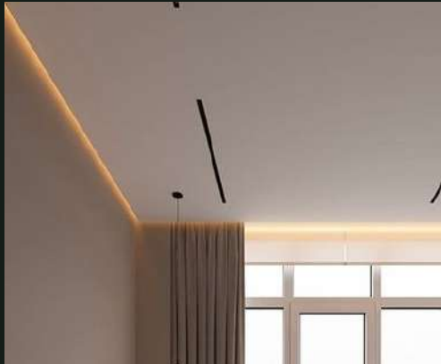
Ceiling POP False Ceiling