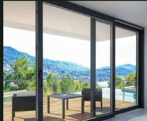
External Doors & Windows Powder Coated UPVC & Glass