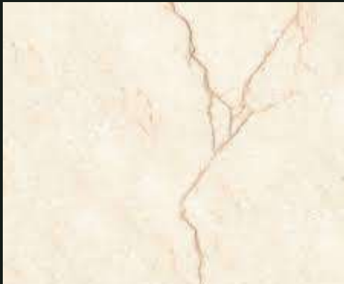
Flooring Italian Flooring