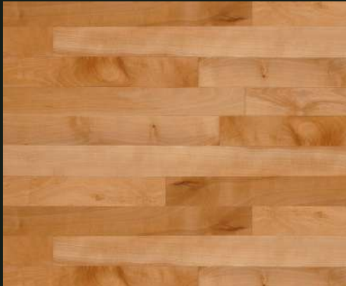
Flooring Wooden Flooring