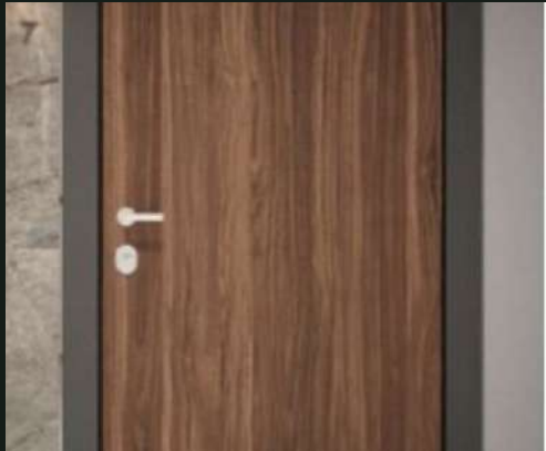
Internal Doors Veneered Polish Door