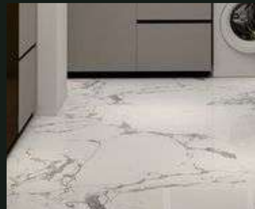
Flooring Italian Marble