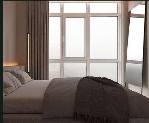
External Doors & Windows Powder Coated UPVC & Glass