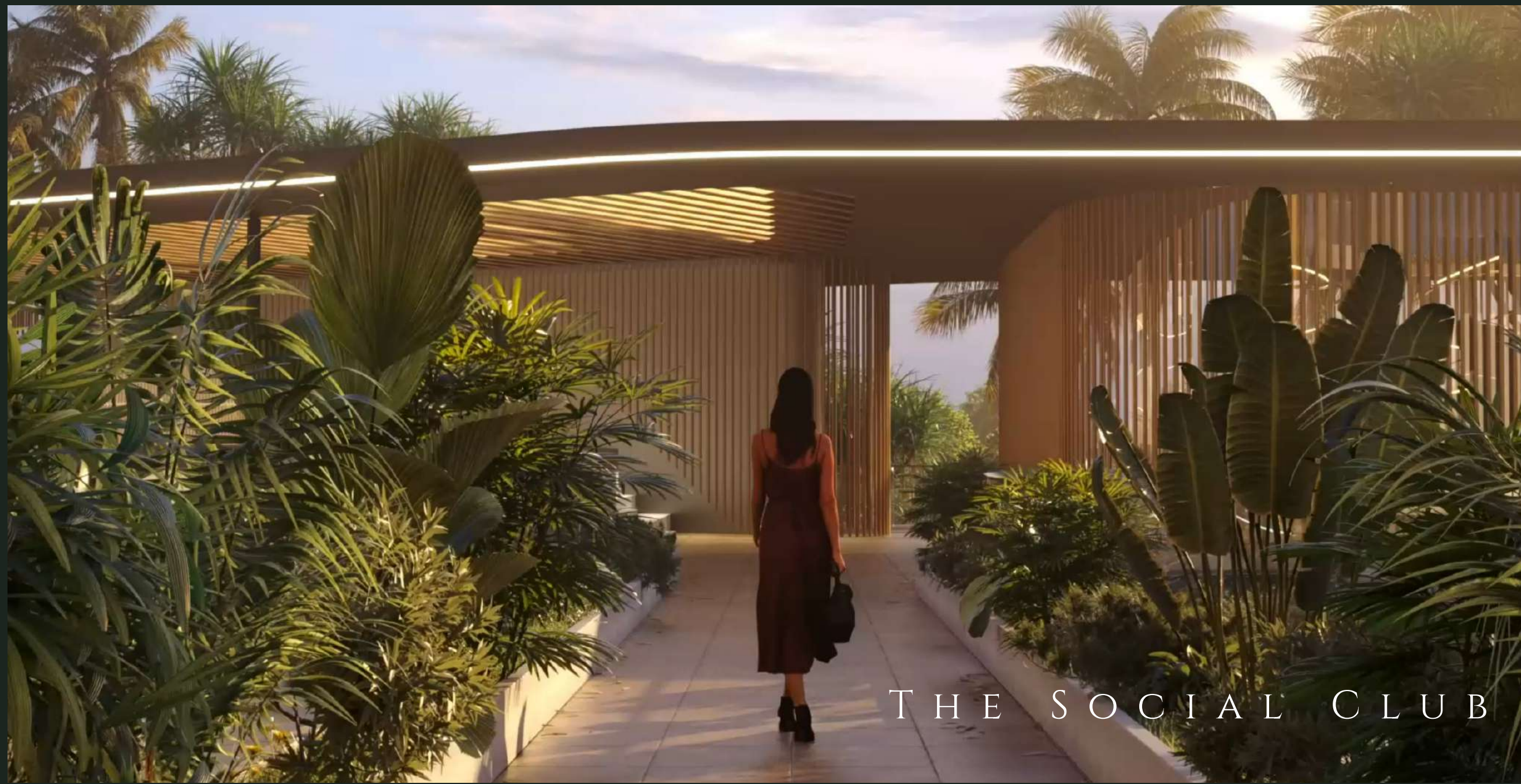
THE SOCIAL CLUB