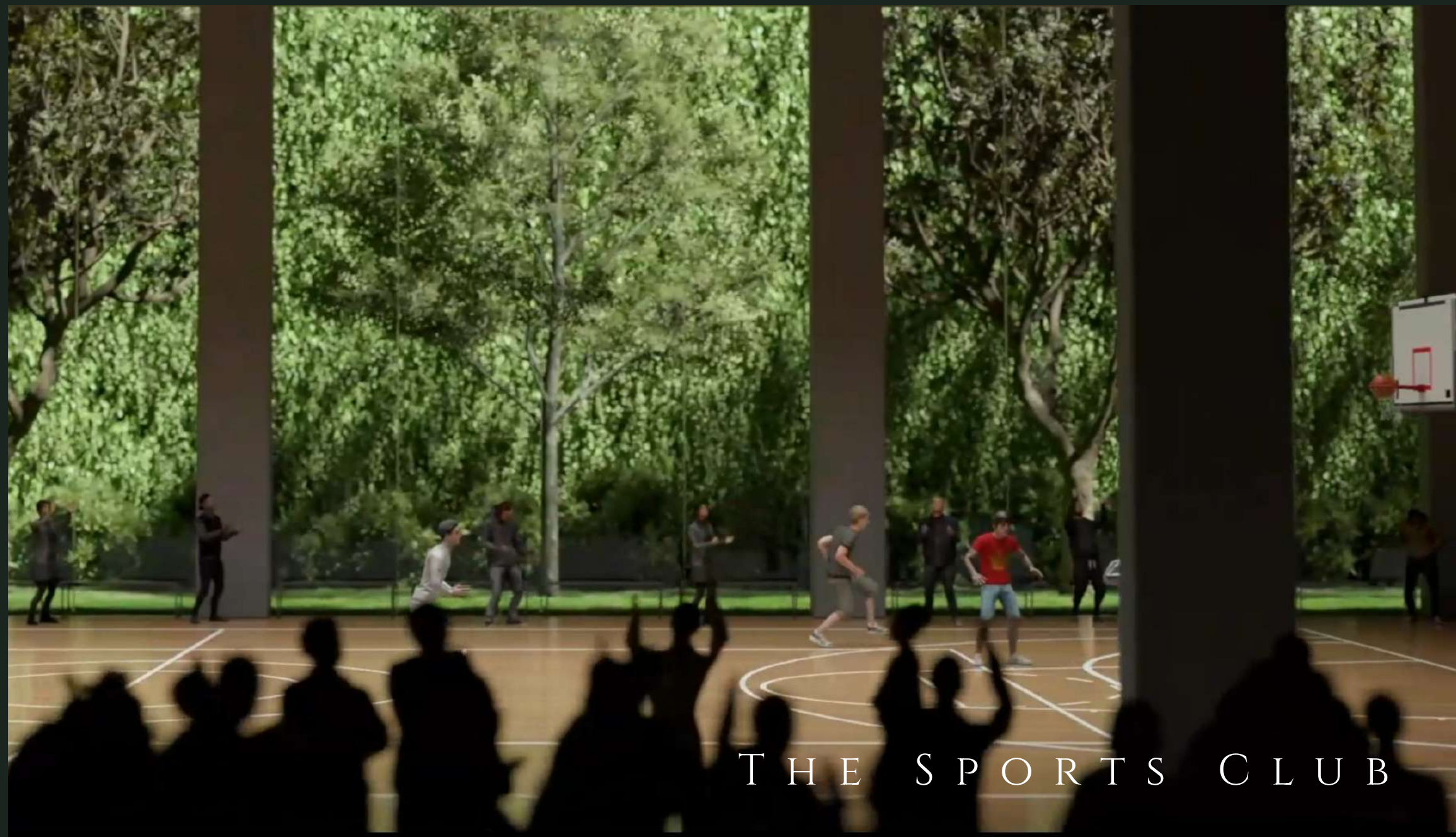
THE SPORTS CLUB