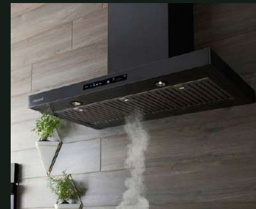
Hob & Chimney International