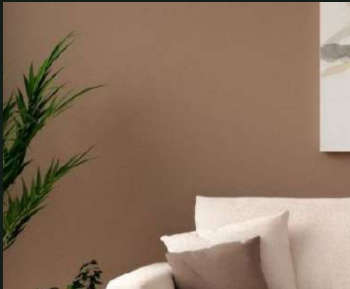
Wall Acrylic Emulsion