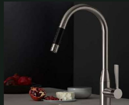
Fixtures and Faucets NSF Certified