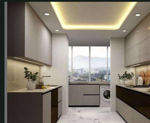
Modular Kitchen Imported Fittings