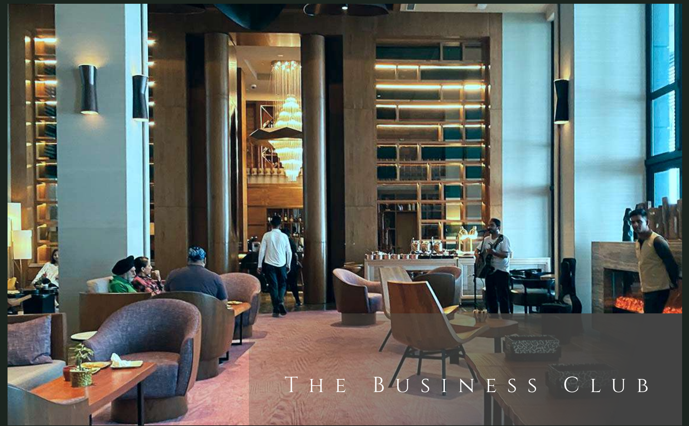
THE BUSINESS CLUB