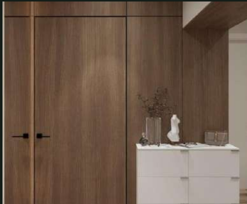
Main Door Veneered Polish Door