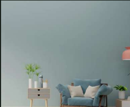
Wall Acrylic Emulsion