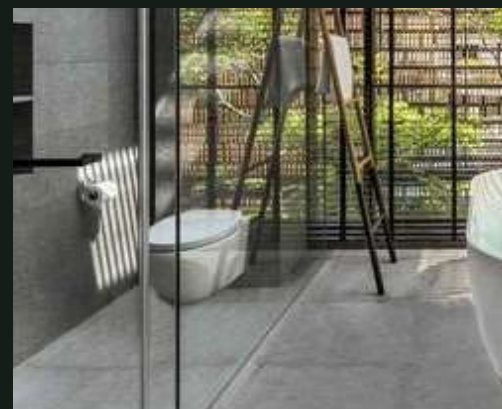
Flooring Vitrified Tiles