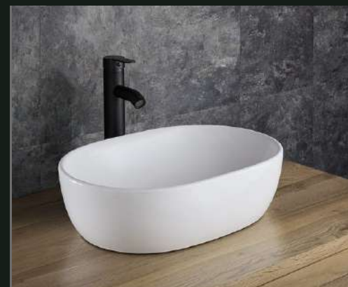
Plumbing Fixtures Branded CP Fittings